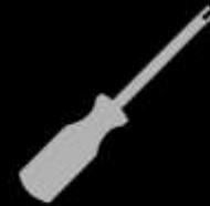
TYRE VALVE REMOVER