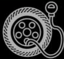
DEFLATOR WITH PRESSURE GAUGE